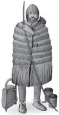
A reconstruction of the Iceman on the move, including cold-weather grass cape, knapsack, bow and other equipment. Courtesy: Drazen Tomic (after Tracy Wellman).