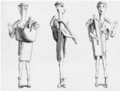
An 18th-century AD engraving, easily recognizable as a record of an early 1st- millennium BC Sardinian bronze figurine, from the Caylus collection. Bibliothèque Nationale, Paris.