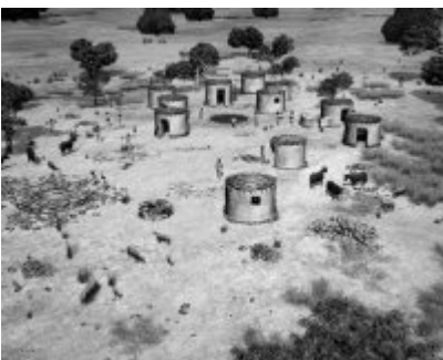
The loose collection of roundhouses constituting the early Cypriot village of Shillourokambos, set in this reconstruction within a savannah-like landscape with semi-free-ranging yet carefully managed herds.