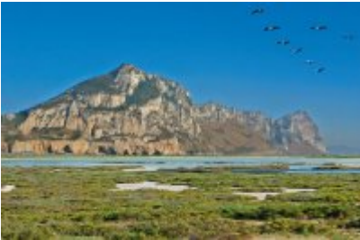
The rock of Gibraltar as it looks today and as it might have appeared during phases of lower sea level to the Neanderthals occupying large caverns along its base.