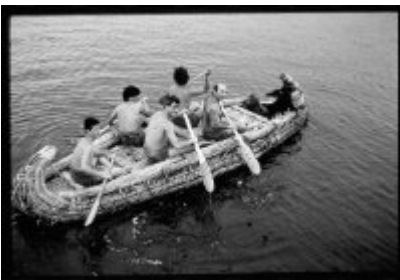
Experimental travel in a hypothetical reed boat.