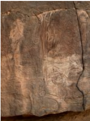
Early rock engraving of cattle being milked at Tiksatin, Libyan Sahara.